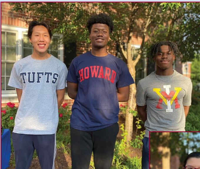
Proud graduates of AHC's 2021 College & Career Readiness Program. We can't wait to celebrate more high school graduates during AHC's 2022 College Signing Day in May. Thank you, AHC supporters!