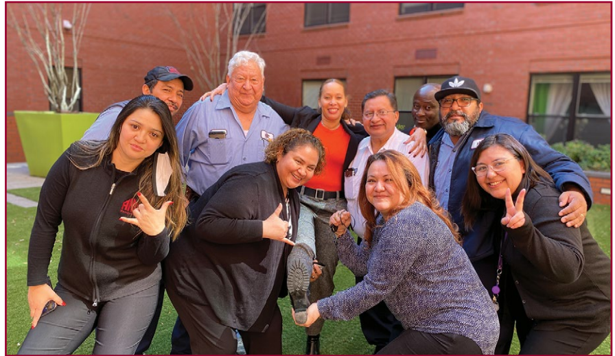
Hardworking property staff celebrate successful building inspections at three of AHC’s older Arlington properties – Harvey Hall, Gates of Ballston, and Arbor Heights. All passed comprehensive Arlington County inspections with flying colors. Harvey Hall also passed an extensive HUD inspection.

AHC selected four property management companies to manage AHC Management’s portfolio, including Drucker + Falk, Harbor Group, Paradigm Management, and WinnResidential. AHC has worked closely with the four companies to position employees and residents for a smooth and successful transition.